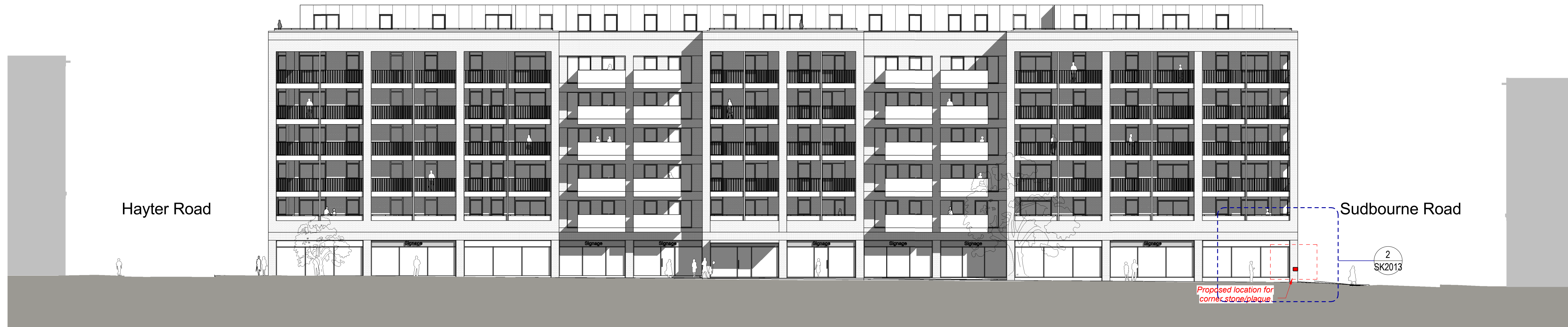
1 Brixton Hill Elevation - Art Proposal 1 : 200

Cartwright Pickard Architects accepts no liability for any alterations to, additions to or discrepancies arising out of changes to such background information which occur after it has been issued by Cartwright Pickard Architects.